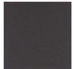
100 Dark Gray