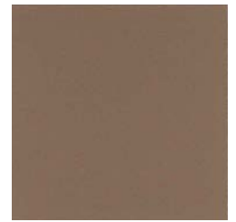
350 Desert Tan