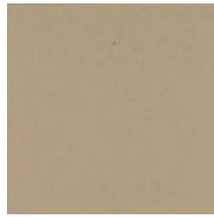
1070 Sandy Buff