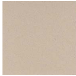
1080 Adobe Buff